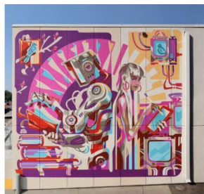
Mural by artist team Key Detail at unBound library